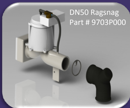
Jets Discharge Valve