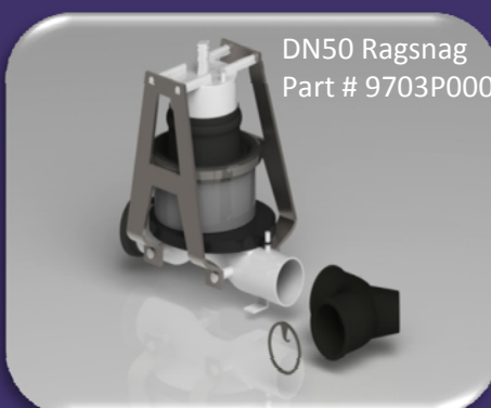
Electrolux Discharge Valve