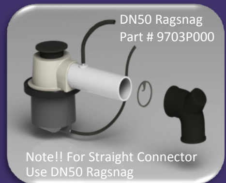
Hamworthy Discharge Valve