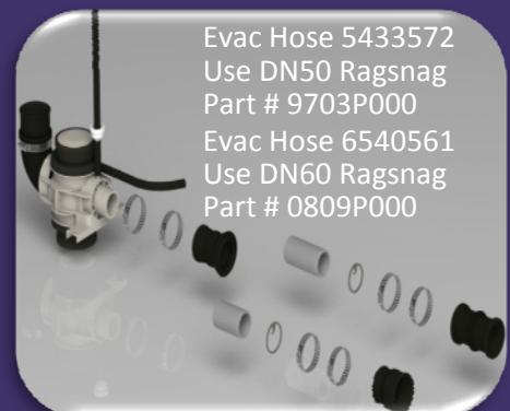
Evac Classic Discharge Valve