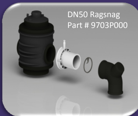
Evac Discharge Valve