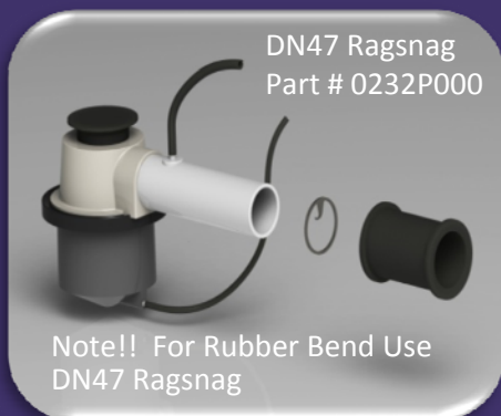
Hamworthy Discharge Valve